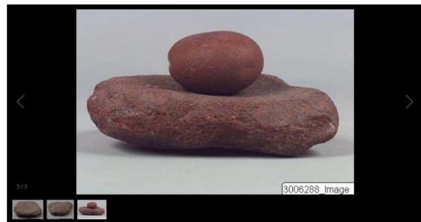
MM 11489 :: Tool, Millstone, Quern

Saddle quern, part of hand mill. Smooth, slightly concave upper surface. Red sandstone.